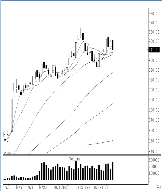
S50Z24 (Close 941.10 Chg -8.50)